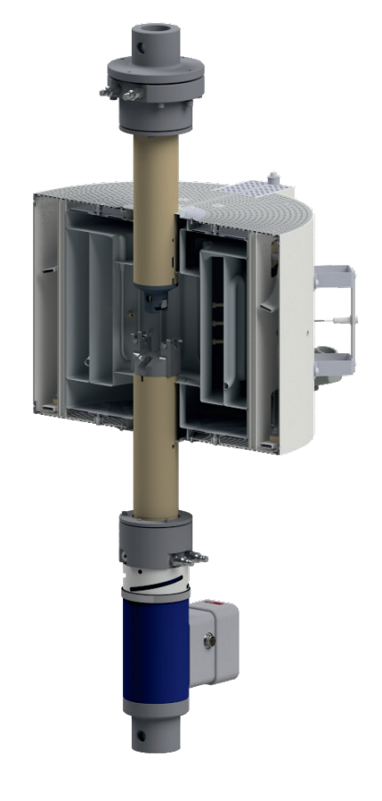
Example PMA-06 in combination with 1600°C 1-Zone Short Furnace HTO-36