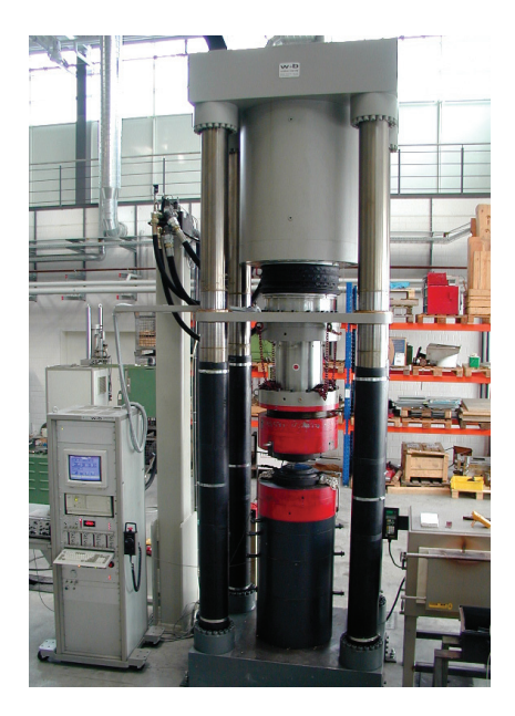
walter+bai Testing Machines